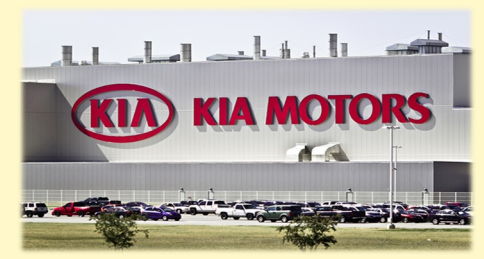
Kia Motors, West Point, GA